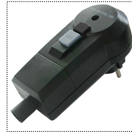
RCD-Plug for unit safety