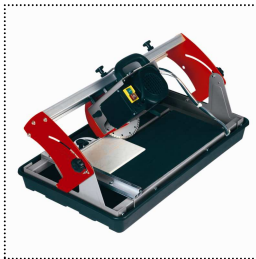
Continuously tiltable motor guidance settings 0° - 45°