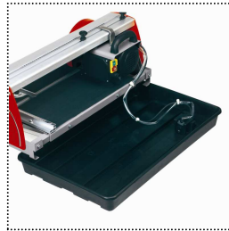
Integrated water pump