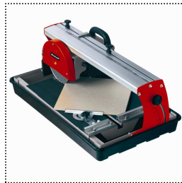
Angle stop with scale for precision cutting