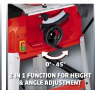
2 IN 1 FUNCTION FOR HEIGHT & ANGLE ADJUSTMENT