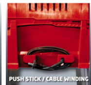
PUSH STICK / CABLE WINDING