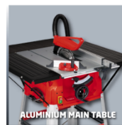
ALUMINIUM MAIN TABLE