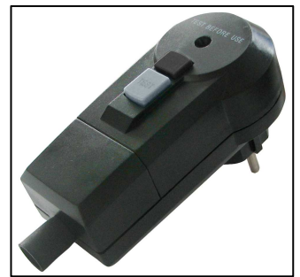
RCD plug for machine safety