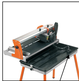
Large water pan with integrated water pump