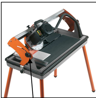
Continuously tiltable motor guidance settings 0° - 45°