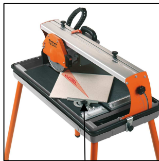
Angle stop with scale for exact cuts