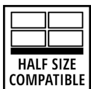
HALF SIZE COMPATIBLE