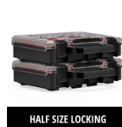
HALF SIZE LOCKING