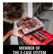
MEMBER OF THE E-CASE SYSTEM