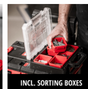
INCL. SORTING BOXES