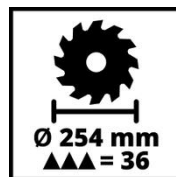
Ø 254 mm ▲▲▲ = 36