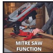
MITRE SAW FUNCTION