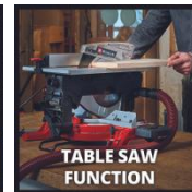
TABLE SAW FUNCTION