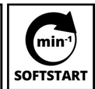
min -1 SOFTSTART