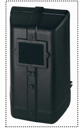
Welding shield included