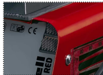
Convenient electrode storage