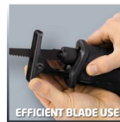
EFFICIENT BLADE USE