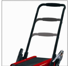
Ergonomically shaped transport handle