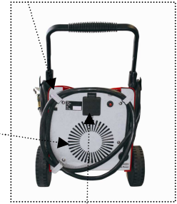
Female connection (230 V) with over-load switch (6 A) at the rear side for external tools