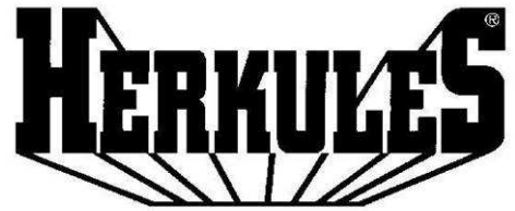
Table Saw TK 1500 UV