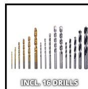
INCL. 16 DRILLS