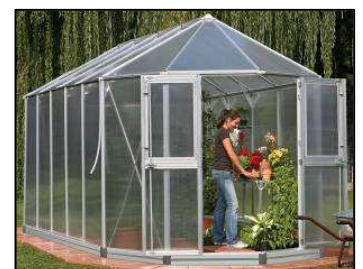
Picture shows ORANGERIE 4/10