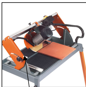
Continuously tiltable motor guidance settings 0°- 45°