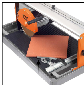
Angle stop with scale for precision cutting