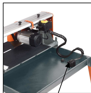
Large water pan with integrated water pump