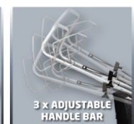
3 x ADJUSTABLE HANDLE BAR