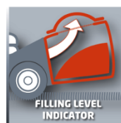
FILLING LEVEL INDICATOR