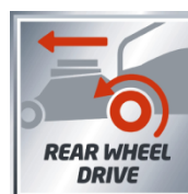
REAR WHEEL DRIVE