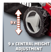
9 x CENTRAL HEIGHT ADJUSTMENT