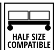
HALF SIZE COMPATIBLE