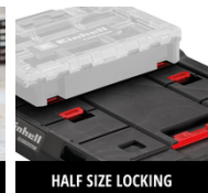
HALF SIZE LOCKING