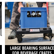
LARGE BEARING SURFACE FOR BEVERAGE CRATES