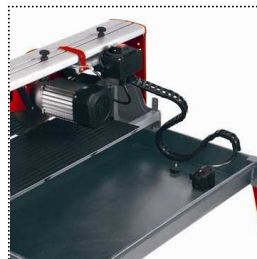
Water trough with integrated pump for cooling water supply and drain plug