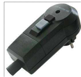
RCD-plug for machine safety