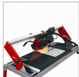
Infinitely swivelling motor guide from 0°-45°