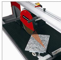
Angle-perfect adjustable angle stop for exact cutting