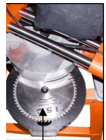
Convenient saw blade storage on the backside