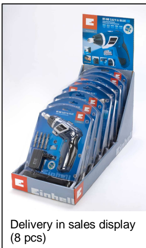
Delivery in sales display (8 pcs)