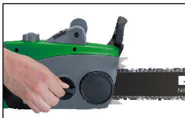
Tool-free chain tensioning