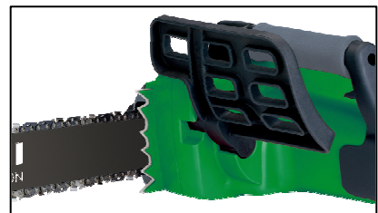
Sturdy metal claw stop