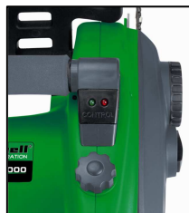
LED indicator for operation and overload protection