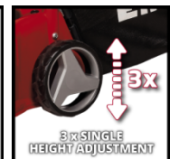
3x SINGLE HEIGHT ADJUSTMENT