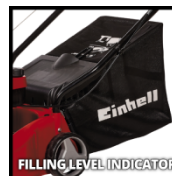
FILLING LEVEL INDICATOR