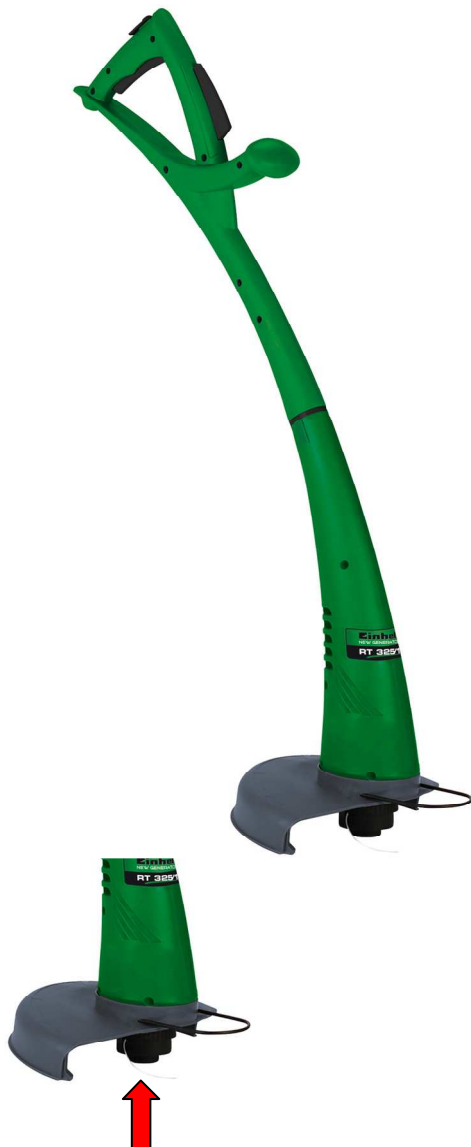
Tapping mechanism for thread adjusting

The handy solution for all problem zones in the garden!