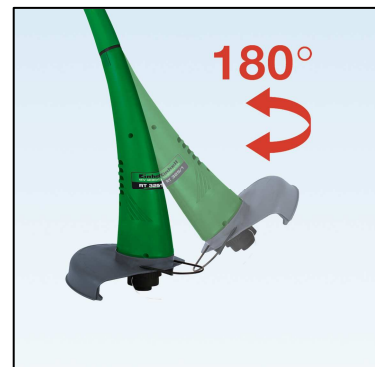
Rotating motor head

Tapping mechanism for convenient thread adjusting. An added plus: the trimmer is enormously space saving.