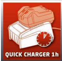
QUICK CHARGER 1h