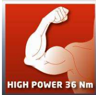
HIGH POWER 36 Nm