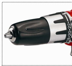
Quality chuck by Peacock