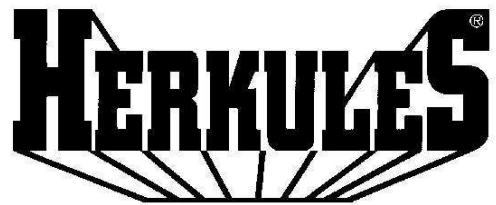
Table Saw BKS 315/400