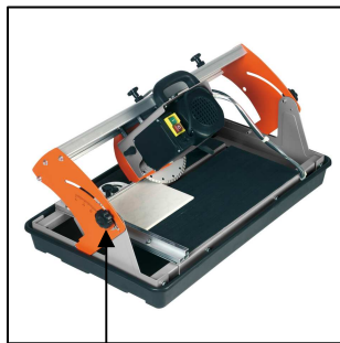
Continuously tiltable motor guidance settings 0° - 45°