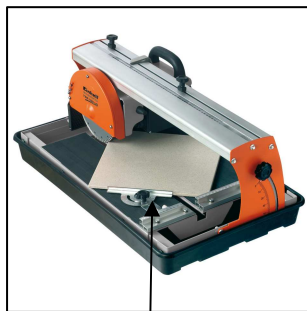
Angle stop with scale for precision cutting