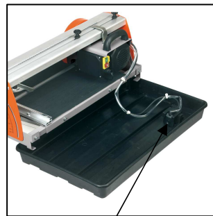
Large water pan with integrated water pump