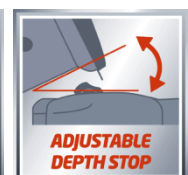
ADJUSTABLE DEPTH STOP