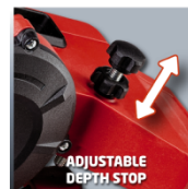
ADJUSTABLE DEPTH STOP