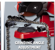
GRINDING ANGLE ADJUSTMENT