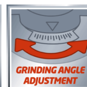
GRINDING ANGLE ADJUSTMENT