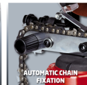
AUTOMATIC CHAIN FIXATION