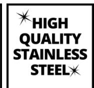
HIGH QUALITY STAINLESS STEEL