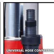
UNIVERSAL HOSE CONNECTOR