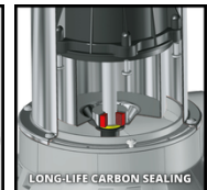
LONG-LIFE CARBON SEALING