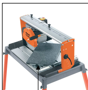
Angle stop with scale for precision cutting