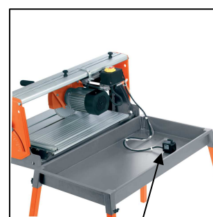
Integrated water pump