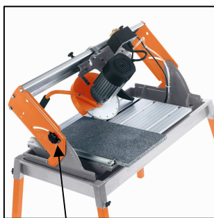
Continuously tiltable motor guidance settings 0° - 45°