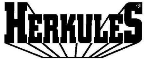
Table Saw TK 1500 UV