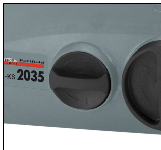
Tool-free chain tensioning