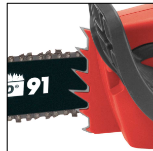
Sturdy metal claw stop