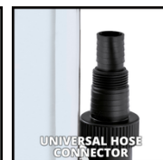
UNIVERSAL HOSE CONNECTOR