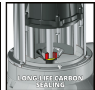
LONG-LIFE CARBON SEALING