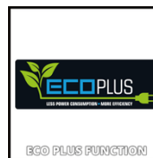
ECO PLUS FUNCTION