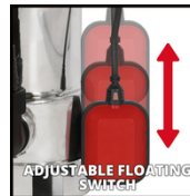
ADJUSTABLE FLOATING SWITCH