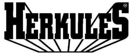
Table Saw TKS 1800 UV