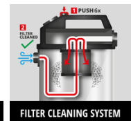
FILTER CLEANING SYSTEM