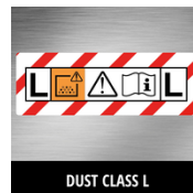
DUST CLASS L