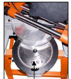
Convenient saw blade storage on the backside