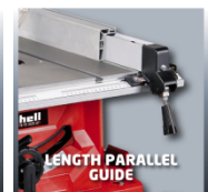
LENGTH PARALLEL GUIDE