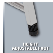
HEIGHT ADJUSTABLE FOOT