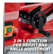
2 IN 1 FUNCTION FOR HEIGHT AND ANGLE ADJUSTMENT