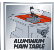
ALUMINIUM MAIN TABLE